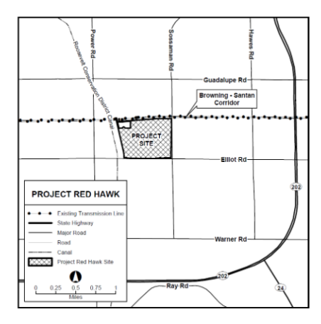
Click on map to open larger version.

The property is located on land that is in an area designated for industrial, employment and mixed-use development. The area is actively marketing to high-tech customers south of the existing SRP Browning to Santan high-voltage power line corridor.